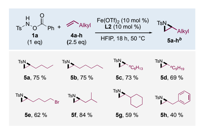
SCHEME 3 Scope and limitations for aliphatic alkenes.<sup>a</sup>

From confronting this aziridination reaction on a larger scale, we were pleased to confirm the robustness of the method (Scheme 4). Indeed, starting from 3 mmol of 1b , we obtained