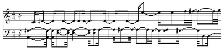
Fig. 3. Example of score obtained with 2 pianos (see the text for other parameters).

The score of the figure 3 has been generated with the following parameters: two instruments (two pianos), for the first one: only 1 playing ant, 60 and 80 as minimum and maximum notes, \beta = 2.0 , T_{\max} = 15 , possible durations are 1-1/2-1/4 , \tau_0 = 0.1 and \rho = 0.01 . For the second piano: 2 playing and 5 silent ants, 40 and 65 as minimum and maximum notes, \beta = 1.5 , T_{\max} = 15 , possible durations are 2-1-1/2 , \tau_0 = 0.3 and \rho = 0.01 . This example shows how it is