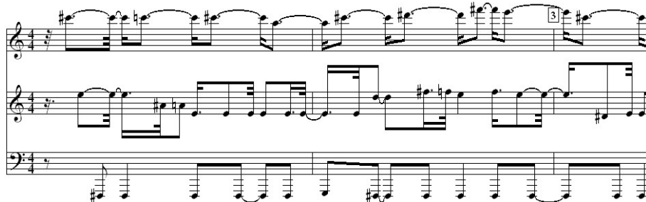
Fig. 4. Example of score obtained with 3 instruments (piano and strings).

The last example in figure 4 shows a score obtained with three instruments: 2 pianos and 1 strings.