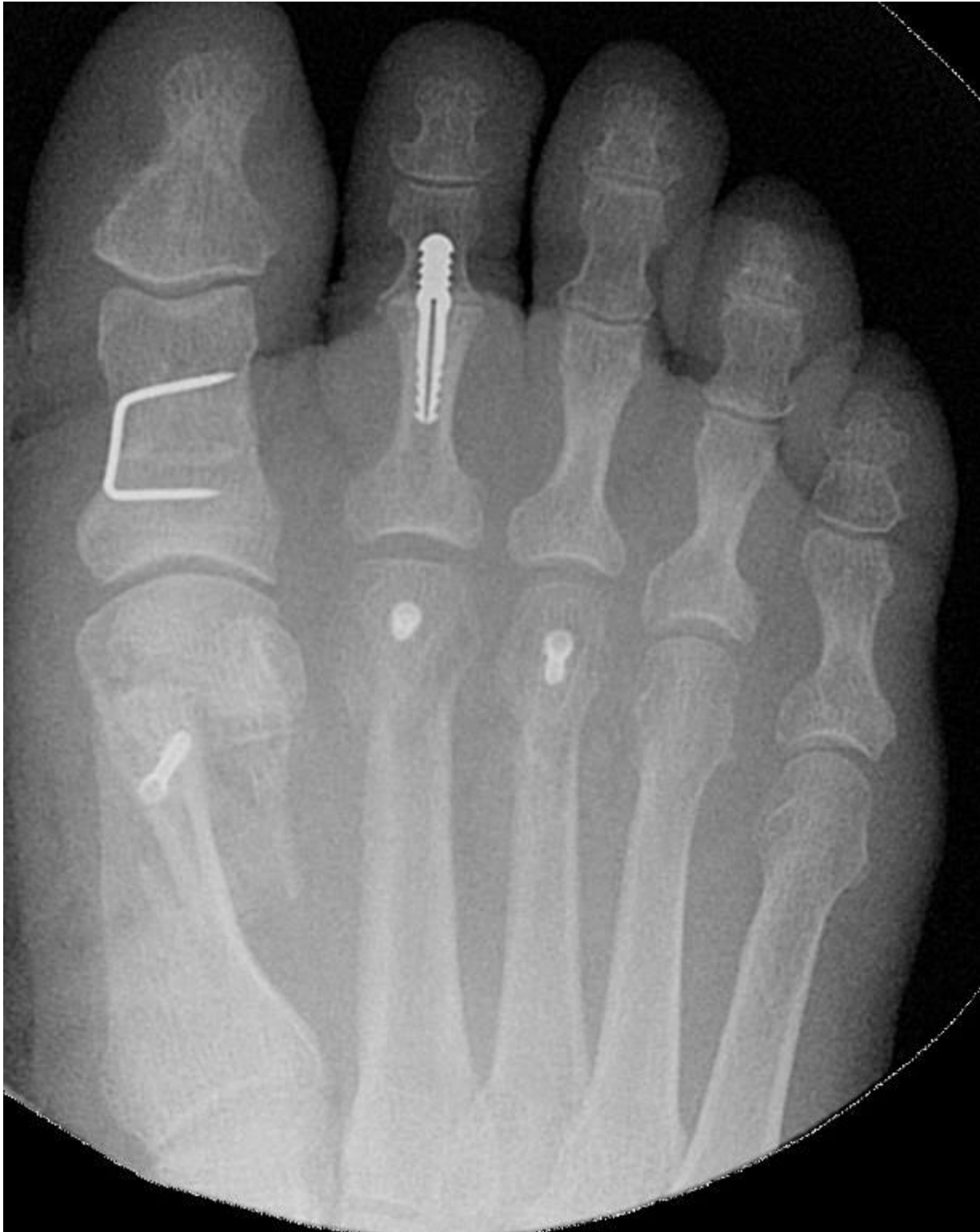
Fig 3: Peri-operative control after dynamic implant positioning