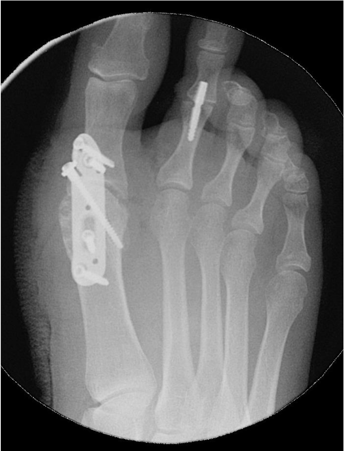
Fig 2: Peri-operative control after static implant positioning