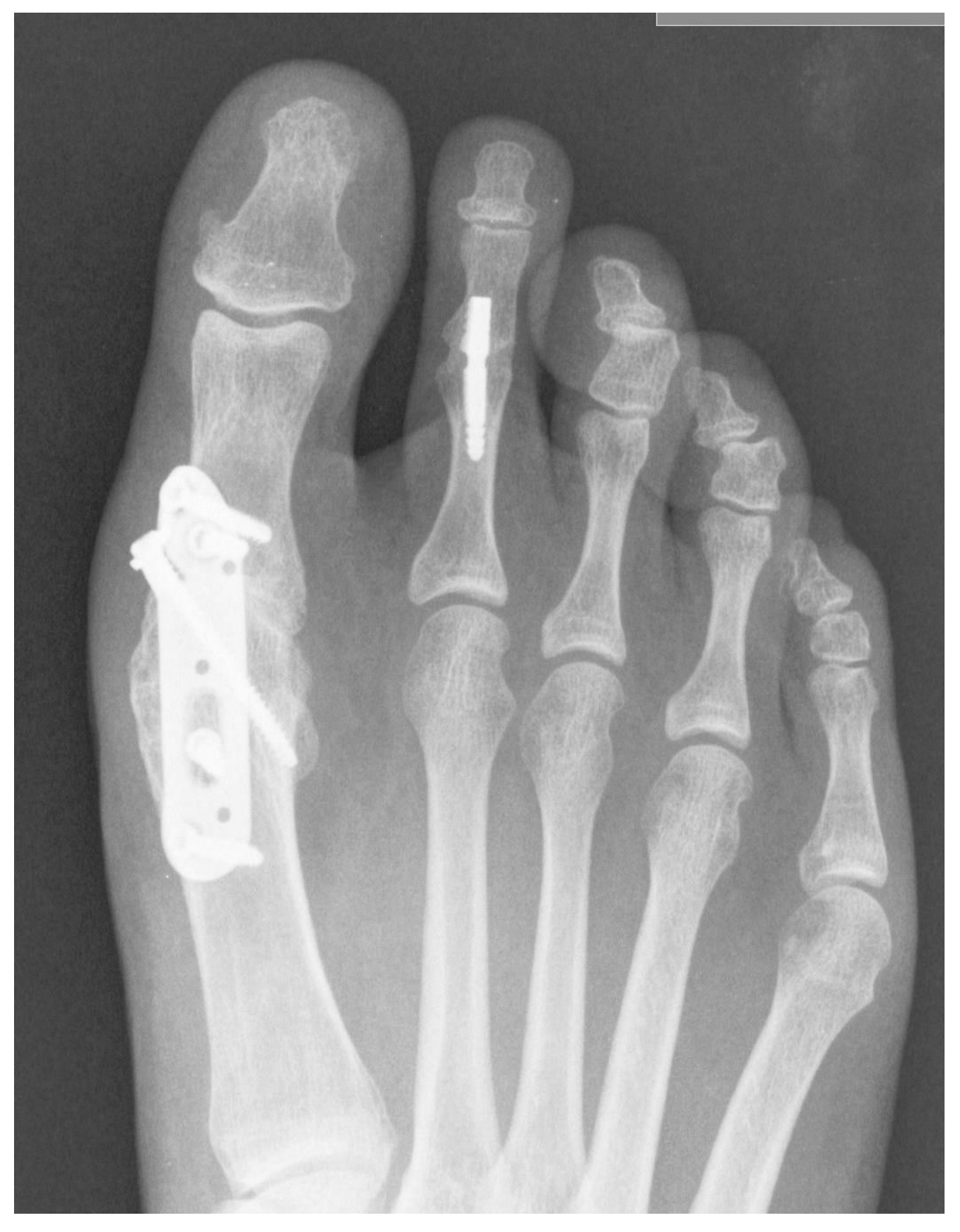
Fig 5: Fusion after one year (static implant)