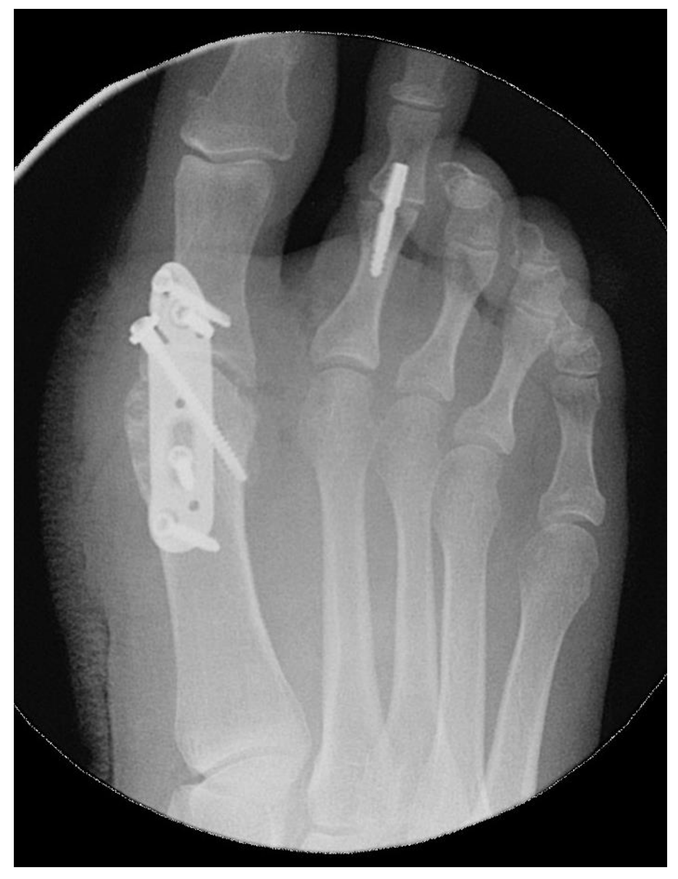
Fig 2: Peri-operative control after static implant positionning