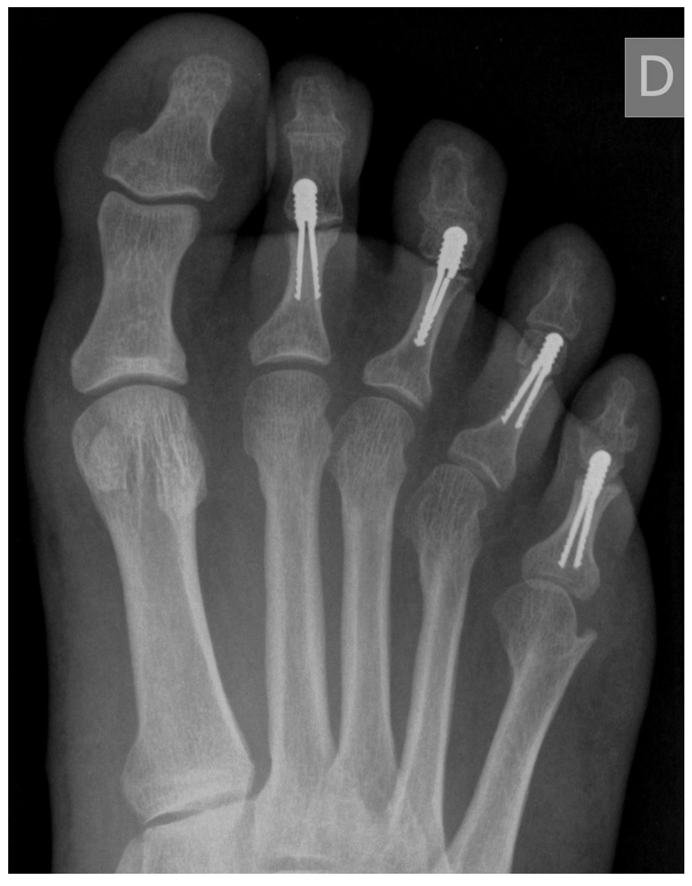
Fig 4: Non-union caused by implant fracture