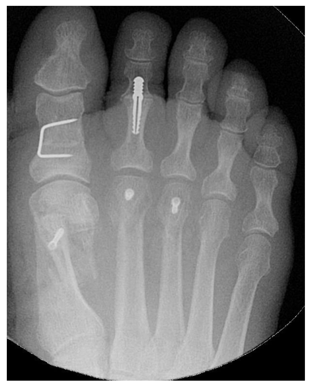
Fig 3: Peri-operative control after dynamic implant positionning