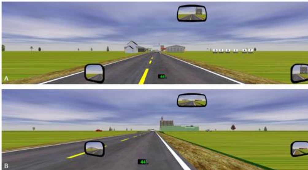
147 148 Figure 1. A: Screenshot of driving scene with a series of billboards on the right side of the 149 road B: Screenshot of driving scene with a red car coming from the left side of the road

145 Participants were instructed to follow a lead car that was driving at 45 mph on average 146 (Figure 1).