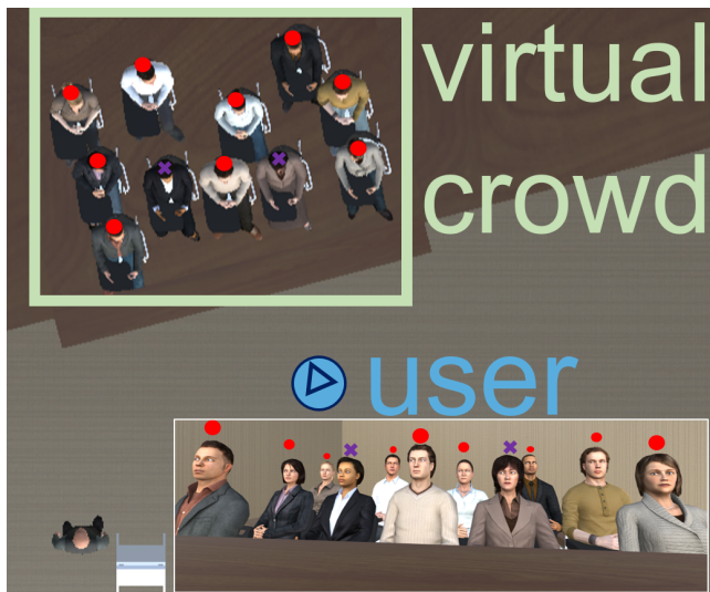
Figure 3: Virtual scene; the user faces eleven agents listening to a speaker standing behind the user. The inset shows the user's view point during the observation task. Active agents are noted by red dots

agents' behaviours, we applied simple blinking animation on their eyes. Then, a specific gaze behaviour was chosen according to the condition at hand, A, D, AD, or DA, as described in Sec. 4.1.