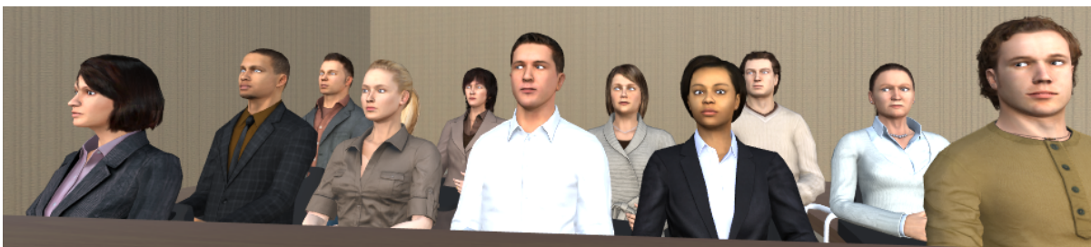
Figure 1: The stare-in-the-crowd effect describes the tendency of humans in noticing and observing, more frequently and for longer time, gazes oriented toward them (directed gaze) than gazes directed elsewhere (averted gaze). This work analyses the presence of such an effect in VR and its relationship with social anxiety levels. The figure above shows an example of the user's view during our experiment. All agents, except the woman in the front row wearing a black jacket, have their gaze averted.

Inria, Univ Rennes, CNRS, IRISA - France