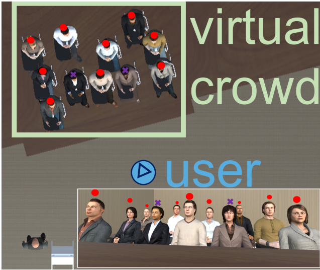
Figure 3: Virtual scene; the user faces eleven agents listening to a speaker standing behind the user. The inset shows the user's view point during the observation task. Active agents are noted by red dots

agents' behaviours, we applied simple blinking animation on their eyes. Then, a specific gaze behaviour was chosen according to the condition at hand, A, D, AD, or DA, as described in Sec. 4.1.