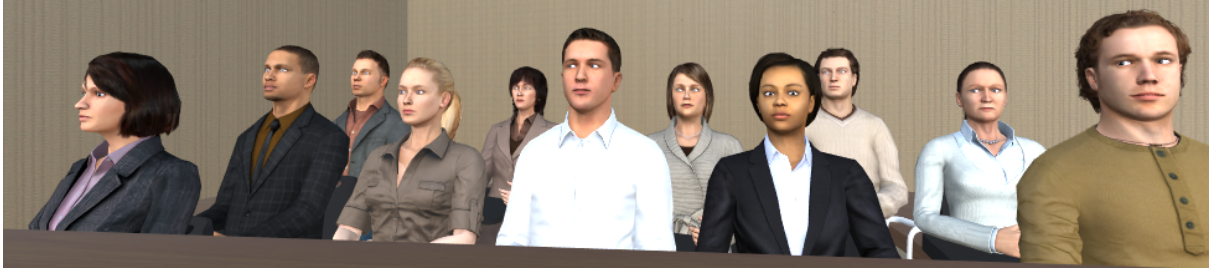
Figure 1: The stare-in-the-crowd effect describes the tendency of humans in noticing and observing, more frequently and for longer time, gazes oriented toward them (directed gaze) than gazes directed elsewhere (averted gaze). This work analyses the presence of such an effect in VR and its relationship with social anxiety levels. The figure above shows an example of the user's view during our experiment. All agents, except the woman in the front row wearing a black jacket, have their gaze averted.

Inria, Univ Rennes, CNRS, IRISA - France