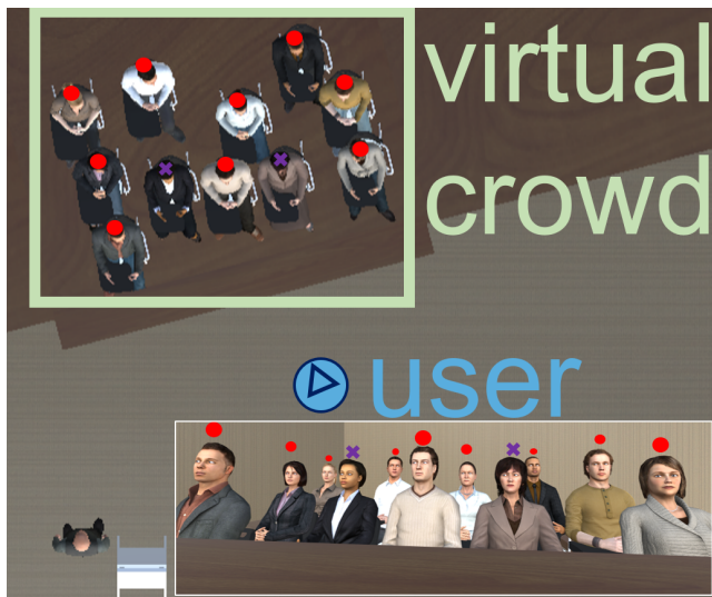
Figure 3: Virtual scene; the user faces eleven agents listening to a speaker standing behind the user. The inset shows the user's view point during the observation task. Active agents are noted by red dots

agents' behaviours, we applied simple blinking animation on their eyes. Then, a specific gaze behaviour was chosen according to the condition at hand, A, D, AD, or DA, as described in Sec. 4.1.