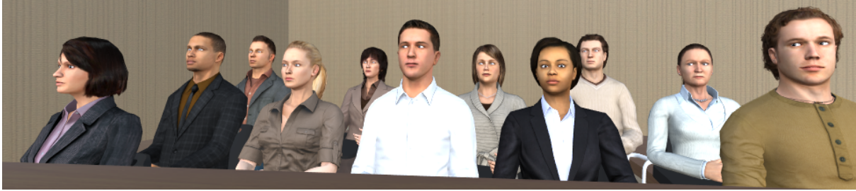
Figure 1: The stare-in-the-crowd effect describes the tendency of humans in noticing and observing, more frequently and for longer time, gazes oriented toward them (directed gaze) than gazes directed elsewhere (averted gaze). This work analyses the presence of such an effect in VR and its relationship with social anxiety levels. The figure above shows an example of the user's view during our experiment. All agents, except the woman in the front row wearing a black jacket, have their gaze averted.

Inria, Univ Rennes, CNRS, IRISA - France