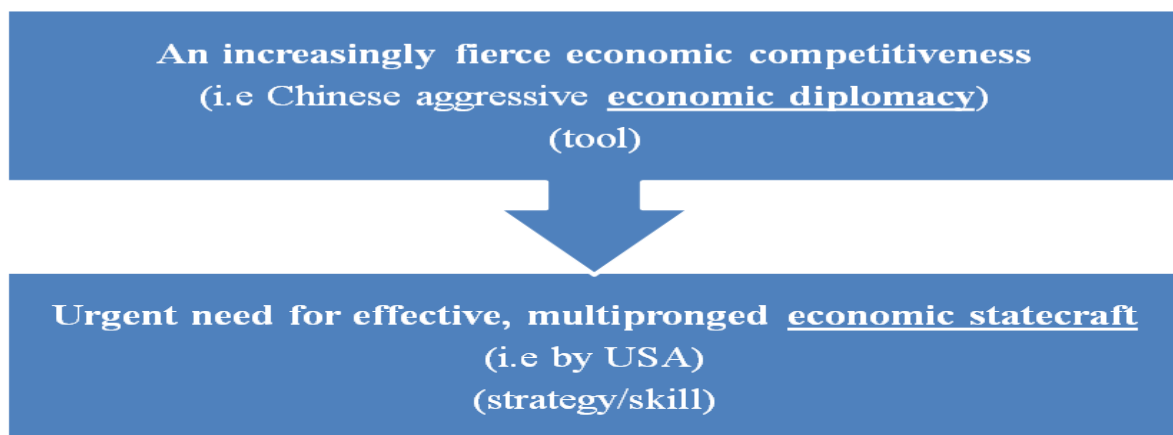
Fig 1: Economic diplomacy (tool) vs. statecraft diplomacy (skill) (Authors)

While words such as forge/policies, open/markets, and boost/prosperity/stability cover internal and external dimensions, targeting wellbeing and social security of the country through large-scale economic dynamics, economic diplomacy, embodied in concepts like negotiate/work for effective use/implementation of that aid, building international coalitions, help countries recover from financial crises, convincing host-government leaders to apply the policies and measures, tends to be more active on foreign platforms, handling foreign economic issues, and fits the much known “trade follows the flag” which, apart from its colonial connotation, implies specific criteria in the choice of strategic partners. Drawing upon the analysis provided by Wayne (2019), whenever economic diplomacy steps into a foreign market, even within a formal diplomatic and trade framework, the growing competitive discourses and strategies employed can justifiably use ‘fierce’ and ‘aggressive’ tools to assure effective implementation of the investing country’s interests (China in this particular stance) and build effective trade links that can guarantee an economic triumphalism but in the framework of peaceful diplomatic obligations (Fig. 1).