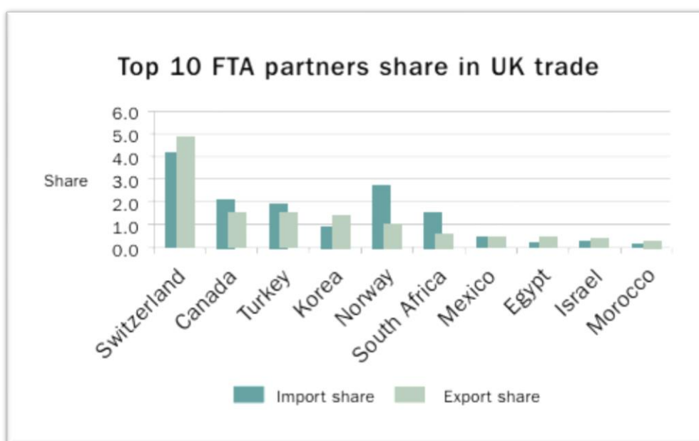
Fig. 2: Top Free Trade Agreement partners share in uk trade in 2016 (Gasiorek & Holmes, 2017, p. 3)

The special relationship between Morocco and the UK dates back over 800 years. Great Britain is considered, in 2020, as the second export market for Moroccan tomatoes. In 2021, it is expected that Morocco will overtake Spain and become the first exporter to the UK. The first country to have ratified an association agreement with UK out of the EU, Morocco signed the agreement in London in 2019, with a view to strengthening bilateral relations post-Brexit (Fig. 2). The Morocco-UK Association Agreement has been operational since January 1, 2021. The association agreement covers goods trade, including provisions on rules of origin, preferential tariffs and tariff quotas, sanitary measures or intellectual property. The agreement also contains limited commitments on trade in services, cooperation commitments in areas often covered by association agreements, including agriculture, education, energy, environment, tourism, and social and cultural issues. In terms of trade, UK exports petroleum products, lubricants, cars, electric motors, and machinery and chemicals to Morocco. British imports consist mainly of clothing, electrical cables, natural fertilizers, chemicals, vegetables and fruit.