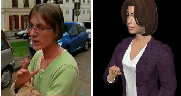
Fig. 2. (a) A real scene annotated by ANVIL displaying a blended emotional behavior combining sadness and anger. (b) A first simulation with the Greta system.