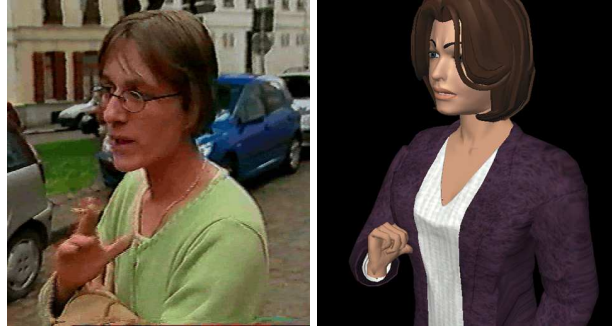
Fig. 2. (a) A real scene annotated by ANVIL displaying a blended emotional behavior combining sadness and anger. (b) A first simulation with the Greta system.