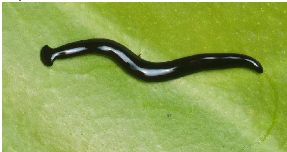
The new species Humbertium covidum.

A hundred animal or plant new species are described each year in metropolitan France. In most cases, these are native species, present here for a long time, but which had so far escaped the attention of scientists. In a very different way, we are now reporting the existence of a new species found in France, but which has been introduced, and which is even potentially capable of invading our gardens.