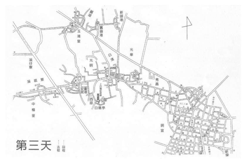
學甲慈濟宮 歲次丙申年上白礁謁祖遶境祭典 (brochure), 中華民國 105 年 (2016) 農曆 3 月 9-11 日 (國曆 4 月 15-17 日), p. 17.

The third day, the cortège moves westwards to include the sacred site of the Siong Be-ta ritual: