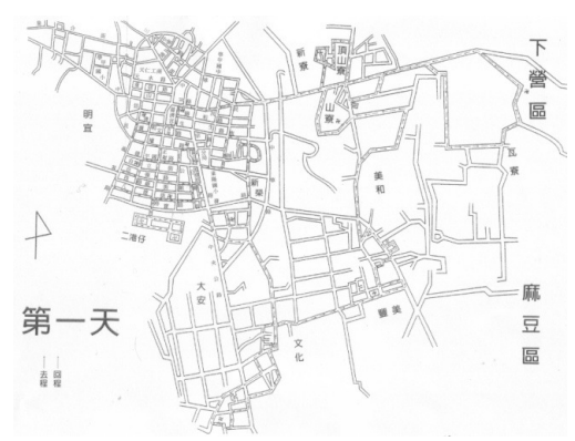
學甲慈濟宮 歲次丙申年上白礁謁祖遶境祭典 (brochure), 中華民國 105 年 (2016) 農曆 3 月 9-11 日 (國曆 4 月 15-17 日), p. 13.

The first day, the procession heads south and then east, as was shown on the map provided to the participating formations, in 2016.