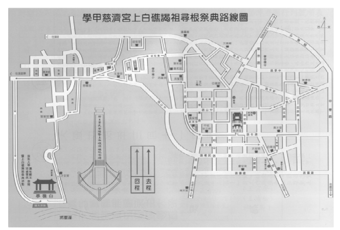
保生大帝臺灣開基祖廟 學甲慈濟宮 歲次戊戌年上白礁謁祖遶境祭典, 星期四中華民國 107 年 (2018) 農曆 3 月 11 日 國曆 4 月 26 日. (leaflet)

The leaflet provided by Ciji gong to the participating formations includes a map of the circuit; the red color on the 2018 document reproduced here indicates the outward route, and the blue color, the return route: