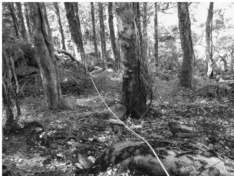
Picture 2: Fire self-extinction in a Betula alba stand, Mezio, NW Portugal.

when an experimental summer fire moved from an untreated 28-year old stand to areas that had been prescribed burnt 2-3 years before (FERNANDES et al. 2004). Differences in fire characteristics between 13- and 28-year old fuels could not be proven, but in a related study (FERNANDES 2009a) surface fire intensity was lower in prescribed burnt plots for at least 10 years after treatment.