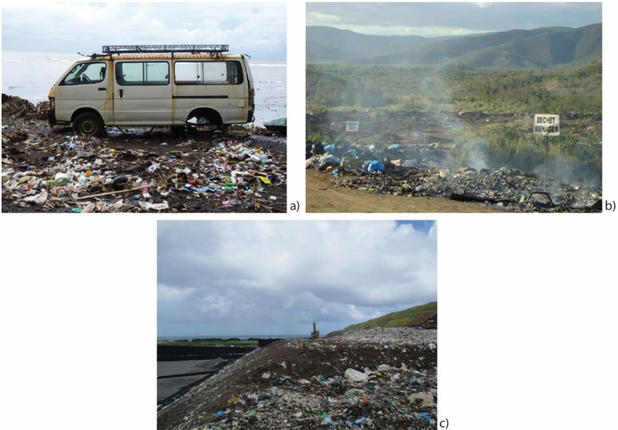
Figure 3: a) Waste on a beach in Ndzuwani; b) Open dumps in New Caledonia; and c) Landfill in Réunion.