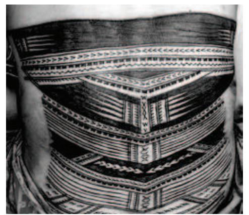
Back of man's pe'a in the making, Vaipu'a, 2005

This unique context resulted in preserving and spreading of Samoan tattooing rituals to the very margin of the community in Australia, New Zealand, USA, and Europe, rendering at the same time UN policies in the preservation of intangible heritage somehow ineffective, insofar as the task of protecting, transmitting, and promoting to generate income had already been undertaken in a very Samoan way, which considers service to and involvement on family obligations as cardinal cultural values.