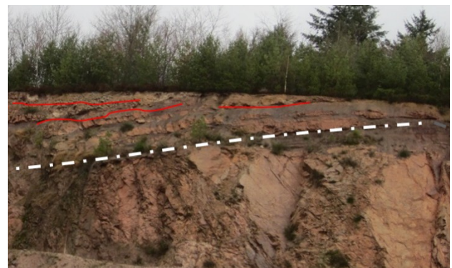
Figure 1. Picture of a man-made outcrop with – in red – bedding of the sedimentary deposit (sandstone) and – dotted white line – the geological limit between sandstone and the crystalline basement rock.

The St Pierre Bois (SPB) site is included in an exploited carrier with a manmade outcrop allowing to visualise the geological contact between the granitic basement and the arkose overlying sediments (sandstone enriched in quartz, with a moderate porosity). It is particularly interesting to have access to the limit between basement rocks and sediment layers as this zone is often referred as a permeable target at depth down to several kilometres and cannot be easily studied. As it is, this particular outcrop can be considered as an analogue of the same transition zone at depth and its study aims at a better understanding of the hydrogeological properties and change in physical properties between the two compartments.