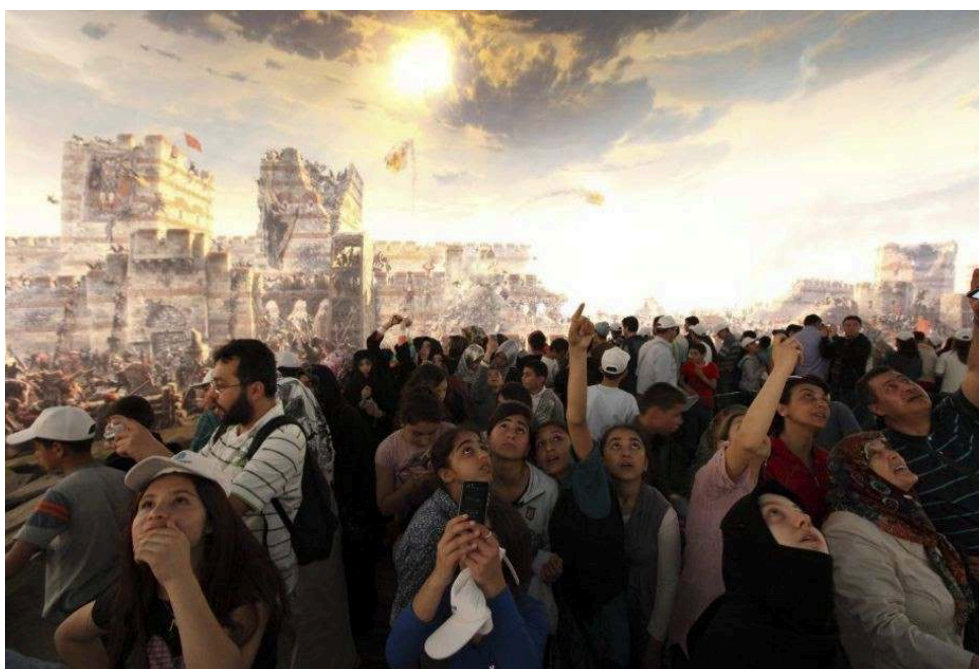
A packed audience on 29 th May 2011 inside the Panorama 1453 History Museum, which displays in 3D the conquest of Istanbul by the Ottoman army