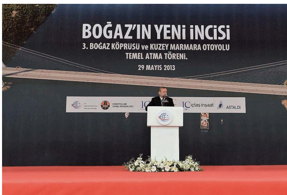
Prime Minister Erdoğan speaking at the ground-breaking and button-pushing ceremony of the Bosphorus Third Bridge and Northern Marmara Highway, 29th May 2013