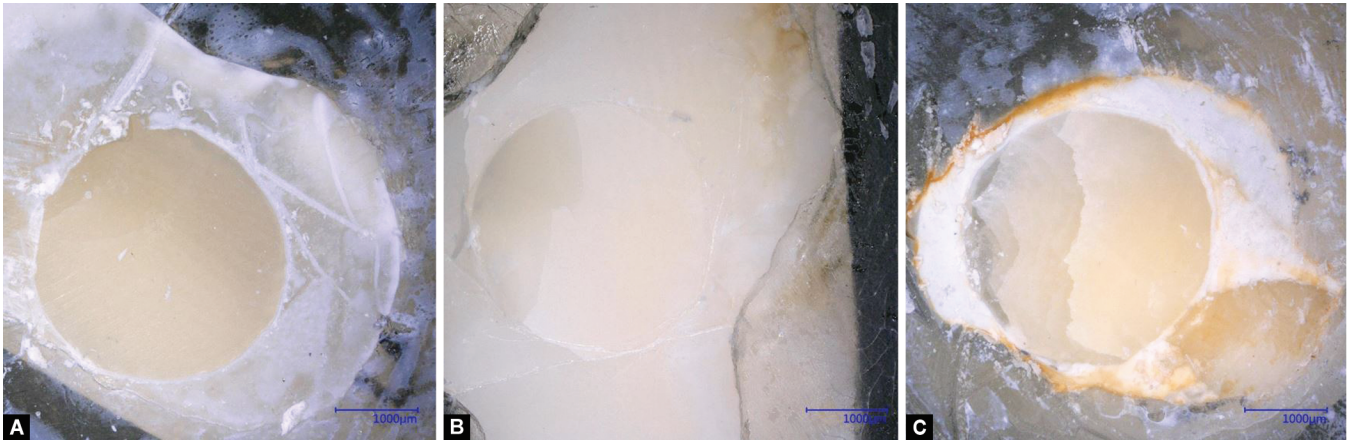
Figs 1A to C: Representative photos of numeric optical microscope of: (A) Adhesive failure ( \times 50 magnification); (B) Mixed interfacial failure ( \times 50 magnification); (C) Cohesive failure in composite layers ( \times 50 magnification)