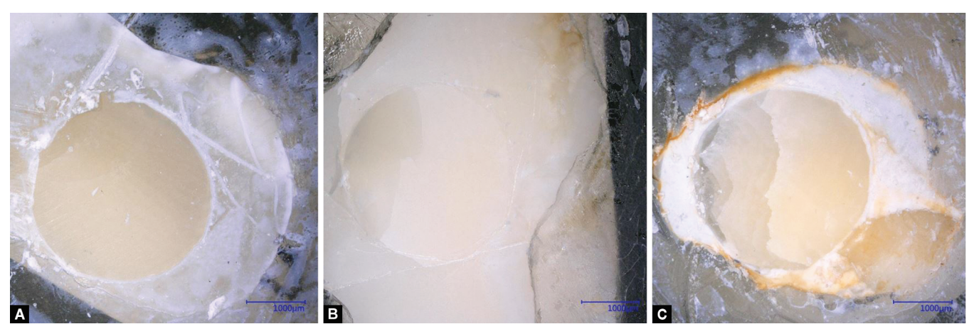
Figs 1A to C: Representative photos of numeric optical microscope of: (A) Adhesive failure (×50 magnification); (B) Mixed interfacial failure (×50 magnification); (C) Cohesive failure in composite layers (×50 magnification)