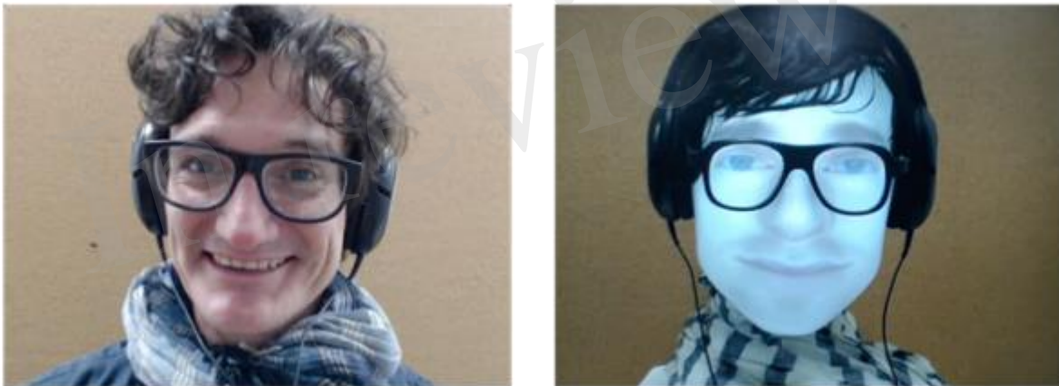
Figure 1. Snapshots from the live video feeds projected to the scanned participants, with the Human (left) and Robot (right) interlocutor.