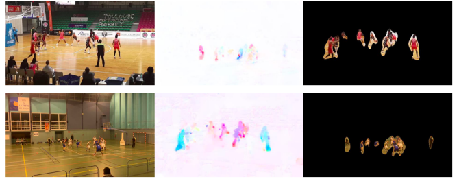
Figure 1: On the left column, images taken from a video. In the middle, optical flow computed from the left image and the previous frame. On the right, background/foreground segmentation.

This part presents optical flow normalization to increase the robustness of our model and to deal with the huge changes between the acquisition positions induced by the amateur conditions (position of the cameraman in the stands, distance