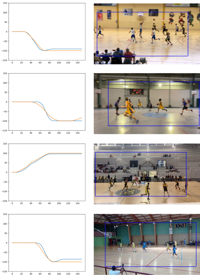
Figure 3: Examples of good tracking results by the algorithm in videos n°2,7,14 and 15 in the database. On the left, the time integration of the predictions. The orange curve corresponds to ground truth camera displacement, the blue one corresponds to the prediction. From top to bottom, curves correspond to videos 2,7,14 and 15. On the right, examples of good tracking results by the algorithm during a camera displacement in these videos. The blue rectangle shows the actual position of the predicted camera. We saw on the curves that on these videos, predictions are closely following the ground truth. In these cases, the predicted camera is quasi not shifted with the ground truth as we can see that the blue rectangle is close to the center of images.