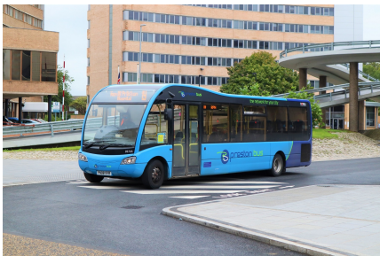
Mobility Allowance Shuttle Transit (MAST)