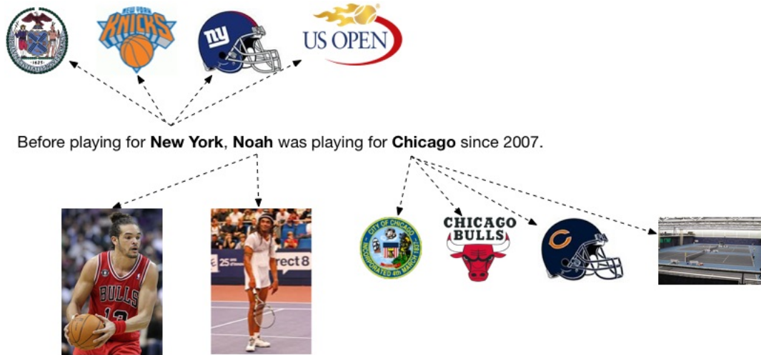
Fig. 1. Figure representing an entity linking task

coming from social media platforms or search queries. Each category of textual content has its own peculiarities. For example, tweets are often written without following any natural language rules (grammar-free, slangs, etc.) and the text is mixed with Web links and hashtags. A hashtag is a string preceded by the character # and used to give a topic or a context to a message. This is why one does not process a tweet like a Wikipedia article;