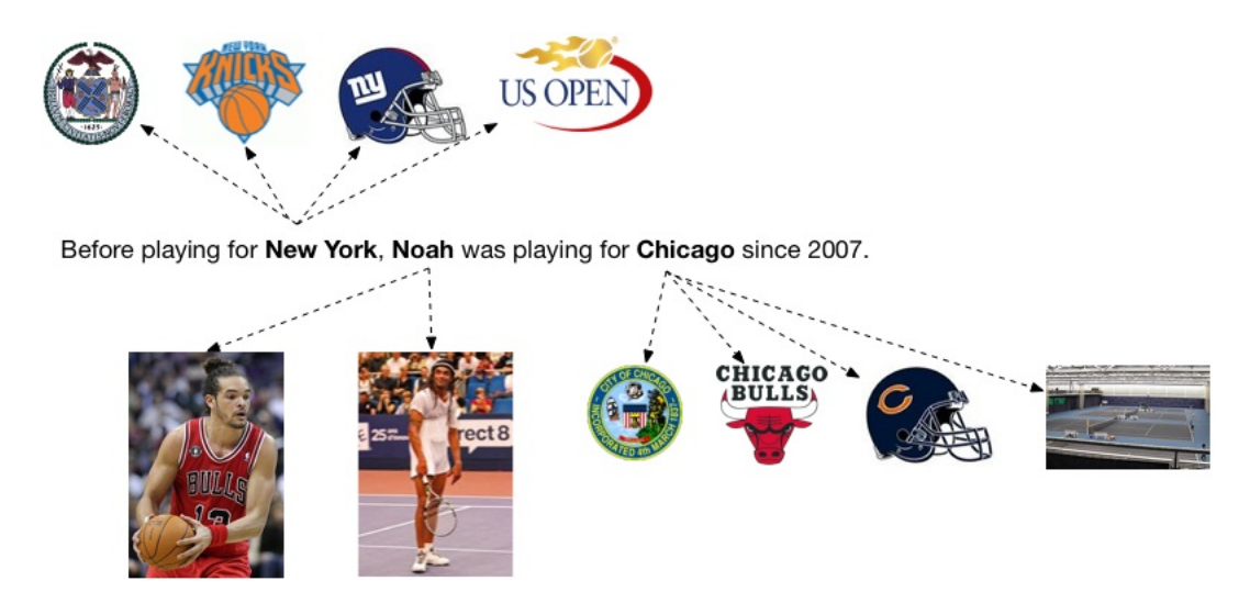
Fig. 1. Figure representing an entity linking task

coming from social media platforms or search queries. Each category of textual content has its own peculiarities. For example, tweets are often written without following any natural language rules (grammar-free, slangs, etc.) and the text is mixed with Web links and hashtags. A hashtag is a string preceded by the character # and used to give a topic or a context to a message. This is why one does not process a tweet like a Wikipedia article: