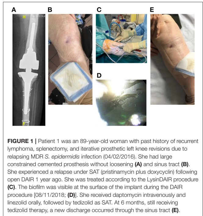
FIGURE 1 | Patient 1 was an 89-year-old woman with past history of recurrent lymphoma, splenectomy, and iterative prosthetic left knee revisions due to relapsing MDR S. epidermidis infection (04/02/2016). She had large constrained cemented prosthesis without loosening (A) and sinus tract (B). She experienced a relapse under SAT (pristinamycin plus doxycyclin) following open DAIR 1 year ago. She was treated according to the LysinDAIR procedure (C). The biofilm was visible at the surface of the implant during the DAIR procedure [08/11/2018; (D)]. She received daptomycin intravenously and linezolid orally, followed by tedizolid as SAT. At 6 months, still receiving tedizolid therapy, a new discharge occurred through the sinus tract (E).

developed worsening of a previous thrombopenia under linezolid therapy. No adverse event was noticed under tedizolid treatment, in particular, neither myelotoxicity nor neurotoxicity. At 6 months, under tedizolid therapy, recurrence of the sinus tract occurred in the two patients with sinus tract at baseline (Figure 1E, Figure 3C). After >1 year of follow up (respectively, 14 and 16 months), the clinical outcome was decidedly favorable for the two last patients with complete disappearance of clinical signs of septic arthritis (Figures 2C, 4C). As a mild joint effusion persisted in one of them (patient 2), a joint puncture was performed. Surprisingly, it revealed the persistence of the S. epidermidis , that remained susceptible to linezolid and tedizolid.