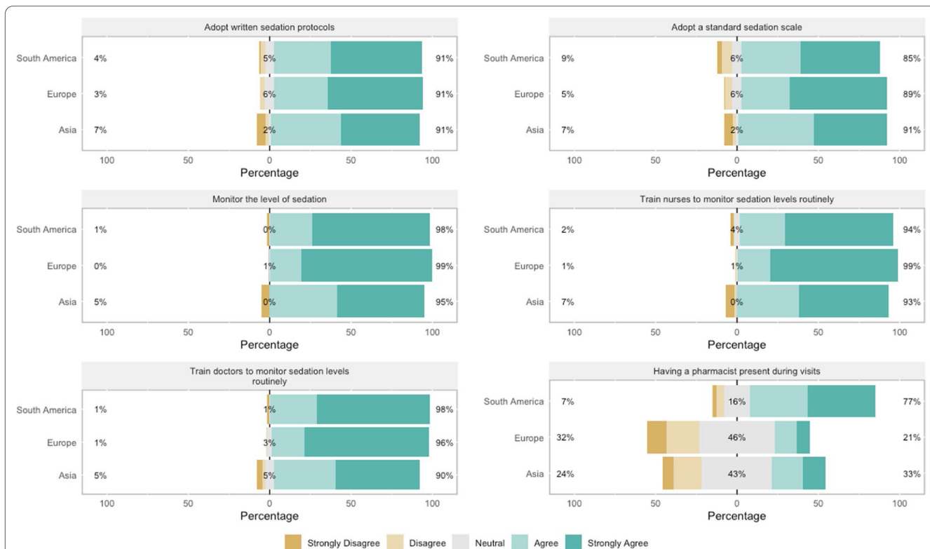
Fig. 3 Physicians' opinions about strategies for improving ICU sedation practices stratified by continents

stay in hospital and ICU and also in adverse drug events caused by prescribing errors [41–43].