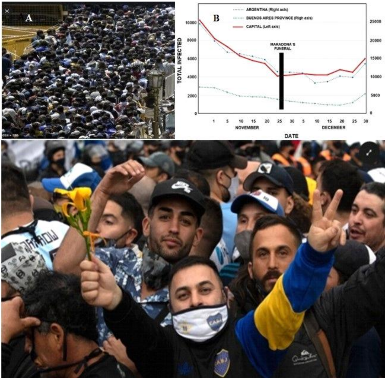
Figure 1: Funeral of Diego Maradona in Buenos Aires, Argentina. The main panel depicts mourners waiting to pay respects in front of the casket. Inset A shows an elevated view of the crowd along a city block. Inset B presents the number of COVID-19 daily infections reported by government sources in the capital city of Buenos Aires (red line), its provincial suburbs (green line) or corresponding to national figures (blue line)

The compliance of mask wearing at the largest public gathering in Argentina during 2020 was