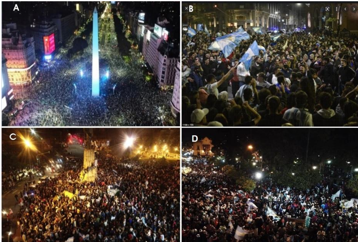
Figure 2. Soccer World Cup celebrations in largest cities of Argentina. Insets A, B C and D shows elevated views of the crowd in Buenos Aires, Rosario, Cordoba and Salta, respectively.

We performed an analysis of face mask wearing during America's Cup celebrations similar to that described for Maradona's funeral. Such an analysis of 348 recognizable faces (in 18 independent photos at various locations) revealed that 84.5\% \pm 17\% of the participants in the Americas cup celebrations did not wear face masks. This sampling size ( n=348 ) of a population estimated at over 4 million across the country (see above) assigns to the average of 84.5 % of the persons celebrating the soccer victory and not wearing face mask a 6.9 % error with a confidence of 99%. The continued chanting and shouting of people in close proximity during many hours of