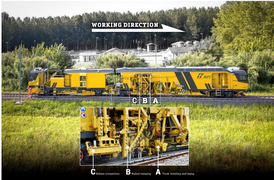
Fig. 1: Ballast tamping machine in operation

After the operation, the ballast is compacted enough (detail C in Fig. 1), to allow trains to travel over it without deformation of the track. This equipment is subjected to strong mechanical constraints sometimes due to heterogeneity of the ballast, so they need frequent maintenance.