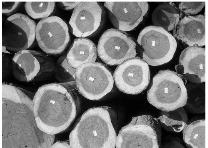
Picture 1: Wood is a mixture of three natural polymers. Several methods of extraction are used to isolate the main constituents.

The Biorafmed project (BIORAffinerie en MEDiterranée, in French) was put together by the CRITT with the help of regional businesses, representatives of the central government, the Regional Government Council, various institutional bodies and academics. The project’s objective is: To set up in the PACA Region a cluster of biorefineries (industrial and/or demonstration facilities) permitting the handling of bioresources, regional whenever possible (specific cultivated crops, gathered plants, domestic waste, cultivated vegetable oil, used vegetable oil), otherwise imported, in order to make bioproducts (biofuel, products identical to those produced by the petrochemical