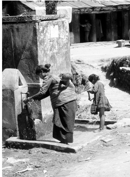
Picture 2: Drinking water in a Nepali village which originates in a forested mountain watershed.

Forest soils act as sponges and retain water longer than soils under other land uses. Tree and forest removal therefore increases water discharge and the risk of flooding in rainy seasons, and the risk of drought in dry seasons. Reforestation and afforestation have the opposite effect on water quantity. However, the role of forests and trees in the moderation of floods and droughts is a question of scale: Forests and trees may reduce the peak and areal extent of flooding at the micro level, and for short-duration and low-impact rainfall events. The extent of large scale flooding in the lower parts of major river basins does not seem to be linked to the degree of forest cover and the management practices in the catchment