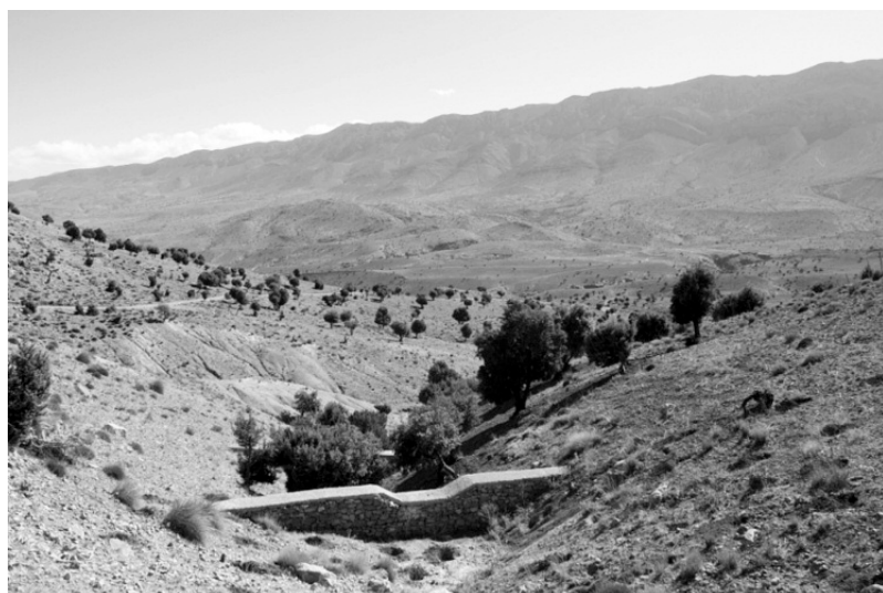
Picture 3: Scattered trees and a dry river course in the High Atlas of Morocco.

services they provide requires careful consideration in land use planning and decision making. In particular, if the management goal is to increase water yield in a forest area through tree removal, the potential negative effects on water quality, landslip risk and biodiversity need to be taken into account.