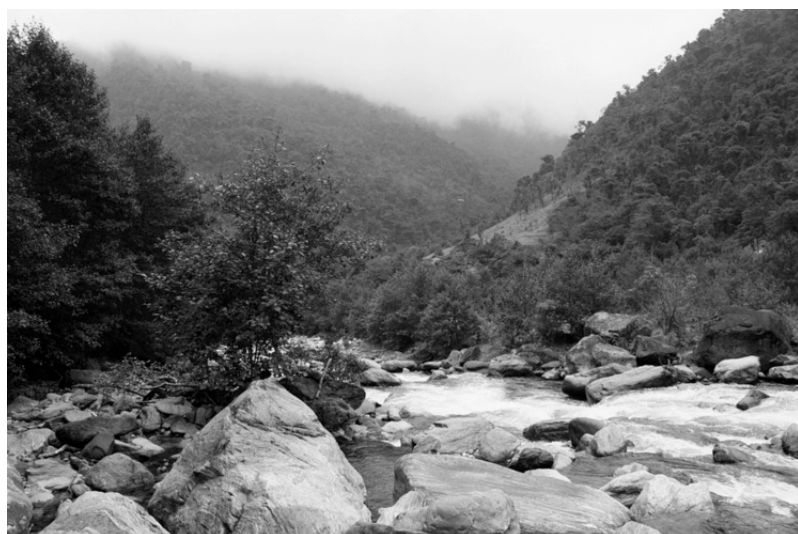
Picture 1: A forested watershed in the Ecuadorian Andes.