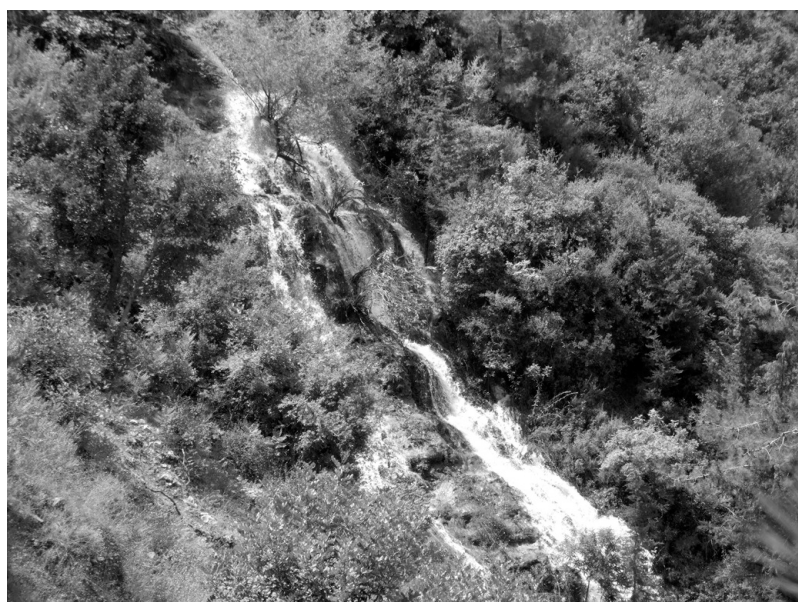
Picture 1 (top): The Mrebbine plain in the region of Dannieh (North Lebanon)