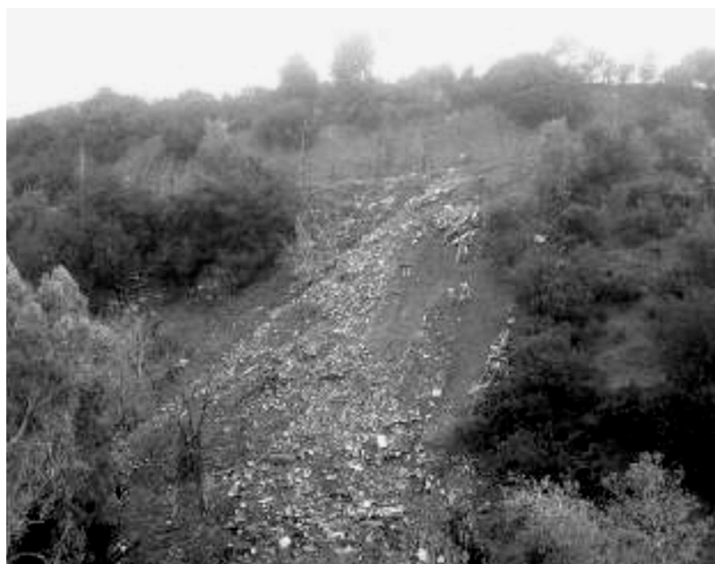
Pictures 12 et 13: In the region, unregulated fly tipping encroaches on woodland areas and rivers

ment at the same time as it pauperises people who are already in difficult financial straits. It seems to us necessary to legalise charcoal burning while establishing a suitable framework at the local level to ensure that cutting is done in a responsible, forest-friendly manner.