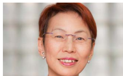
Chizuko Ueno , celebrated Japanese public intellectual, activist, and sociologist reflects on the up-hill road to feminism and assesses its historic gains in Japan and the tasks ahead.