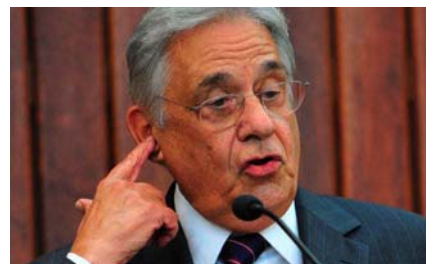
Fernando Henrique Cardoso , two-time President of Brazil (1995-2003), one-time President of the ISA (1982-86), and pioneering sociologist, recounts the advantages and disadvantages of being a sociologist as President.

> Submissions should be sent to burawoy@berkeley.edu