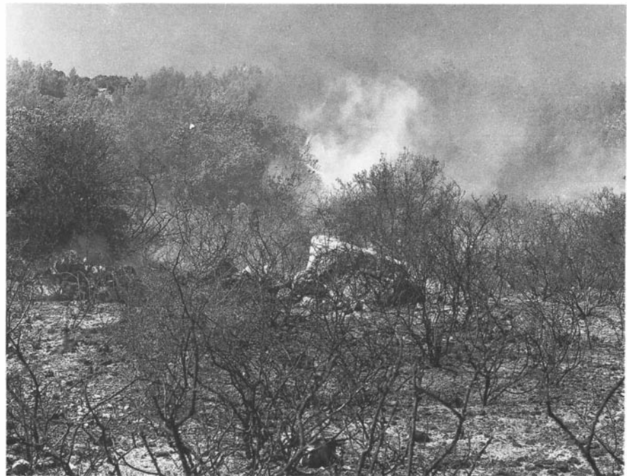
Photos 1 et 2. General views of forest fire in conifer plantations in Israel.