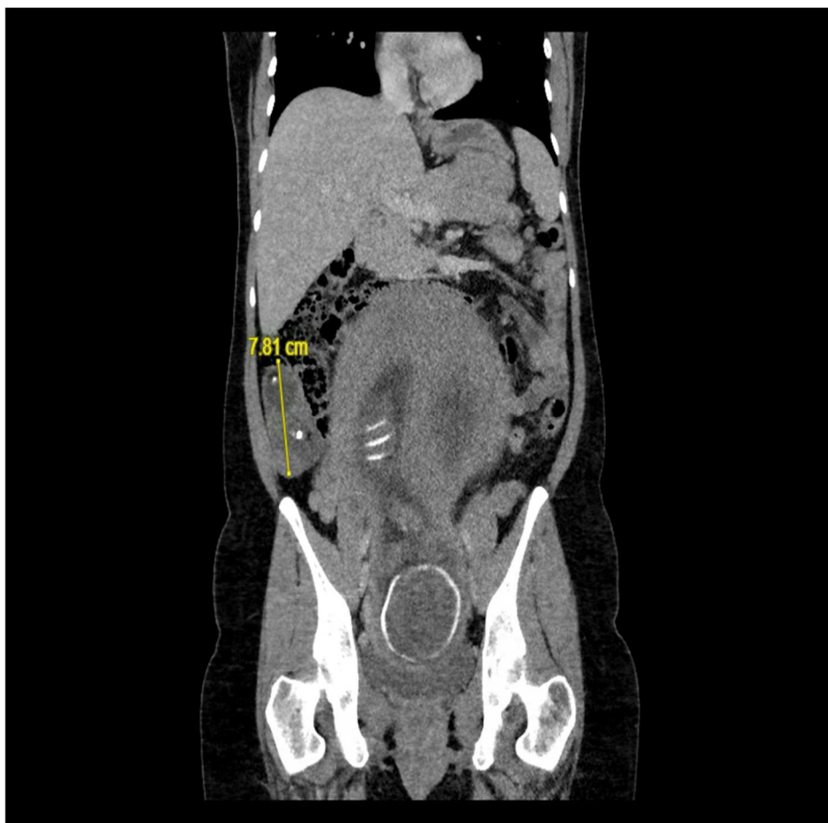
Figure 2. Ovarian Mass on CT scan coronal image