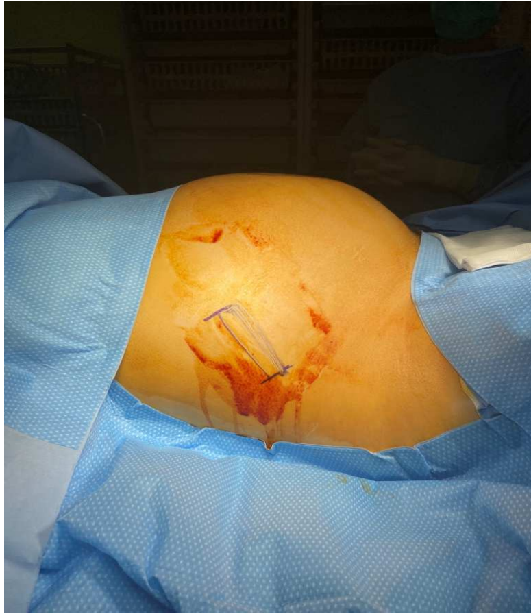
Figure 3: Ultrasound tracking before surgery