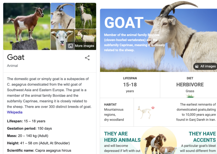
Fig. 1. The Knowledge Panel for the search keyword “Goat” in Google (left) and Bing (right). Screenshot taken on 19/03/2021

through the graph in a follow-your-nose approach. Other common features are plain text search ( /fct on Virtuoso), query helper (YASGUI 3 ), dereferencing service for linked data URI, or rich visualisation of results (like in Wikidata 4 ).