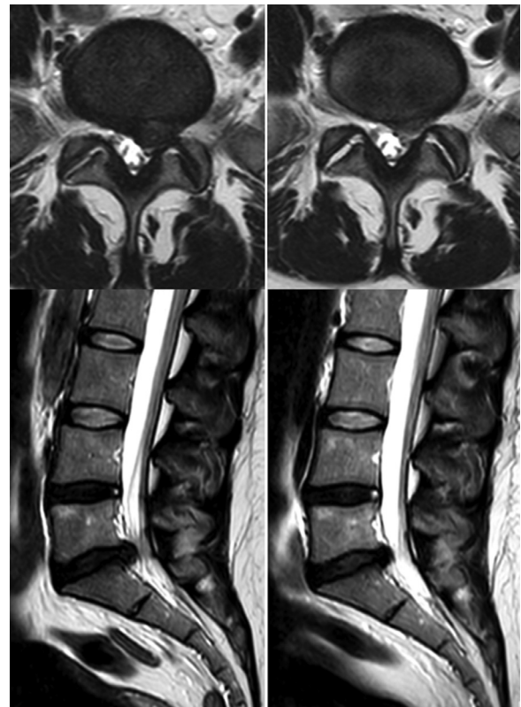
Fig. 3. MRI images before and after oxygen ozone treatment. The figures on the left show TW2 images in axial and sagittal sections in a patient with a left median L5-S1 disc protrusion compressing the left nerve root S1. The figures on the right show the control images at 2 months in this same patient after the intradiscal injection of the oxygen-ozone mixture, with a marked decrease in the size of the herniation.

Treatment was more effective in patients with radicular pain: 100% for isolated radicular pain, 92.3% for mixed lumbar and radicular pain, and 0% for isolated low back pain ( p = 0,003 ).