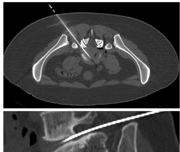
Fig. 1. CT-Guided procedure. Axial (upper) and sagittal (lower) cross-sectional scannographic acquisitions showing the position of the needle in the centre of the disc and the gas diffusion after oxygen-ozone mixture injection.

A CT scan confirmed the diffusion of gas into the disc and the herniation.