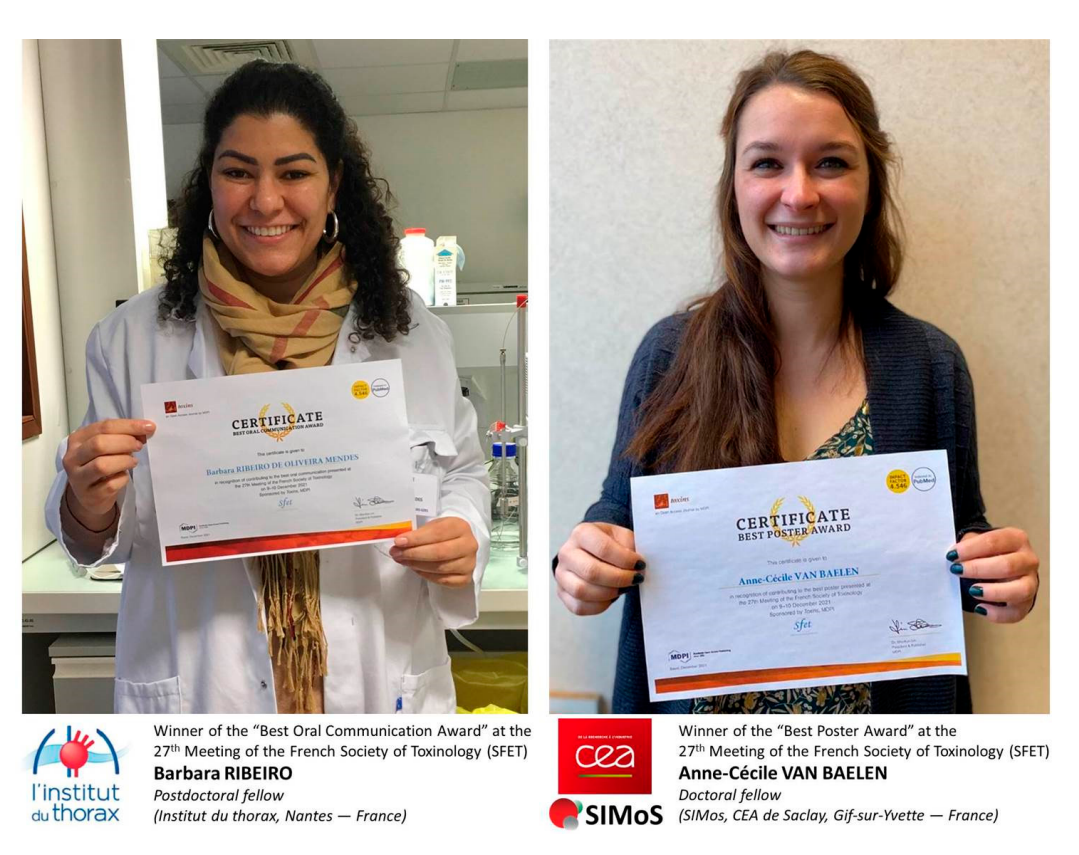
Figure 2. Winners of the "Best Oral Communication" and "Best Poster" Awards at the 27th Meeting of the French Society of Toxinology (SFET).

Owing to a donation from MDPI-Toxins, two prizes of EUR 300 each were awarded to the best oral communication and the best poster (Figure 2), both selected from a vote by all the participants to the meeting.