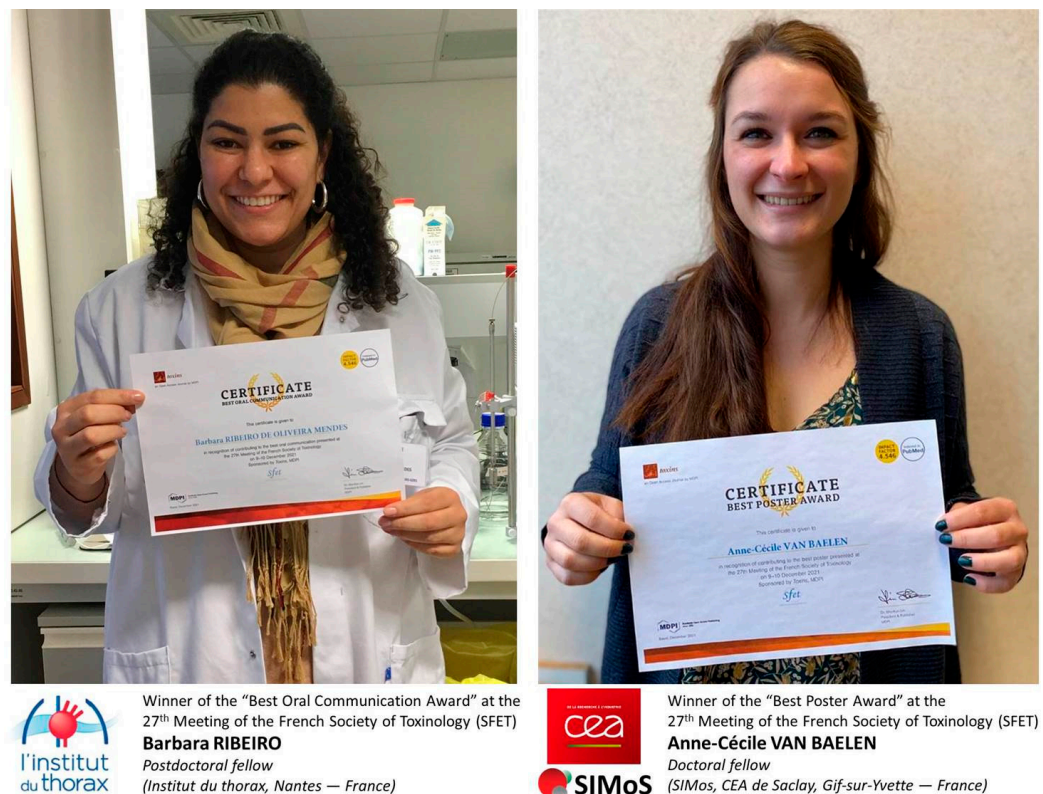
Figure 2. Winners of the “Best Oral Communication” and “Best Poster” Awards at the 27th Meeting of the French Society of Toxinology (SFET).

Owing to a donation from MDPI-Toxins, two prizes of EUR 300 each were awarded to the best oral communication and the best poster (Figure 2), both selected from a vote by all the participants to the meeting.