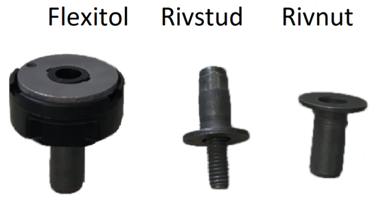
Fig. 2. Types of possible screws

For the first possibility, the part is OK. It can continue its cycle on the production line. For the second and third possibilities, the part is NOK. It should be sent to rework. The distribution of these screws is presented in Table I.