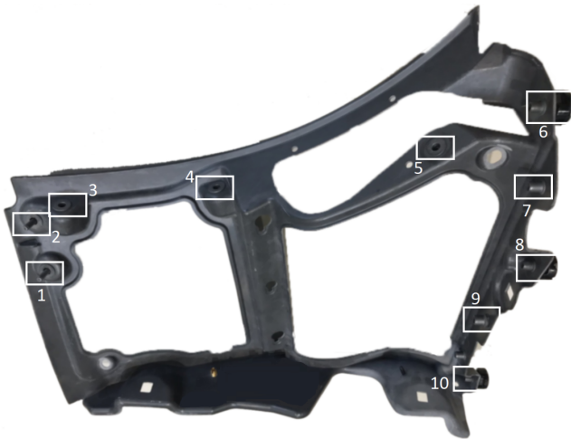
Fig. 1. Sub-assembly part to be checked

The component control should be done while taking into consideration the different lighting conditions of the plant.