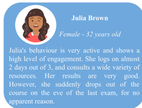
Figure 2: Outlier persona - Withdrawn dataset

Next, one of the outliers of the withdrawn dataset ( Figure 2 ) shows an exemplary behavior at the beginning of the course with high activity (4267 clicks), a high regularity (178 active days), and curiosity (188 consulted resources), but gives up for the last assignment, which is not handed in.