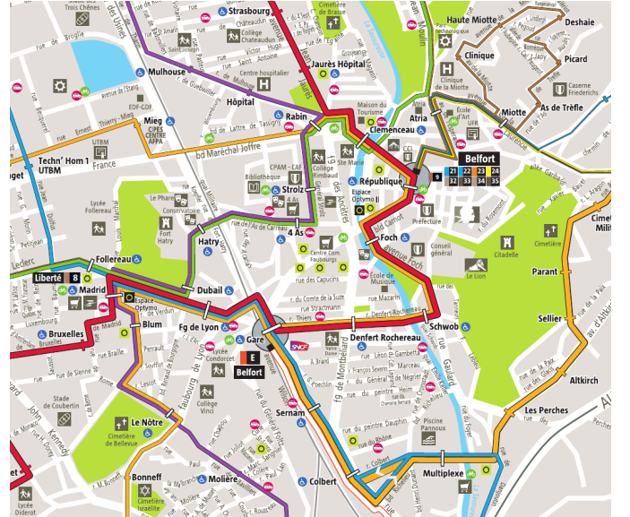
Fig. 1. Public transportation system of Belfort city

The distance of each edge is calculated using the WGS84 ellipsoid formula, based on the set of GPS points between two bus stops. In addition, the energy required to travel the edge is calculated with the energy model, described in section II-D.