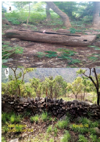
Plate 3: a. Indyer-ilyu from the Benue Trough b. Remains of a Fortified Stone Wall in South-eastern Tivland (Nomishan, 2020).