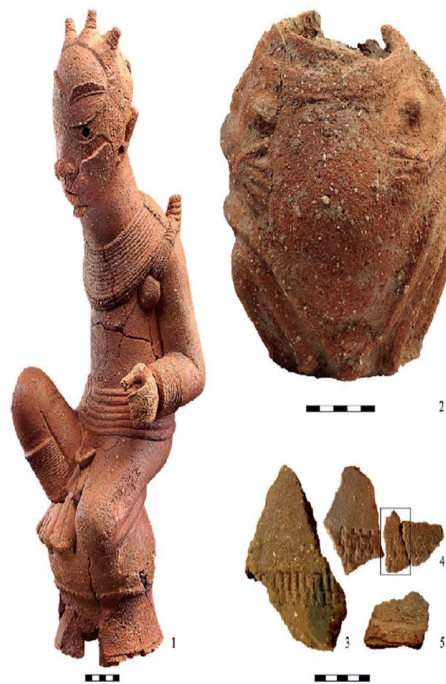
Plate 2: Fired clay objects measured by thermoluminescence in 2013. 1) Terracotta figurine from Daji Gwana; 2) Anthropomorph vessel from Taka Lafiya; 3) Carved roulette potsherd from Ido; 4) Carved roulette potsherd from Tudun Dosa; 5) Potsherd with horizontal application from Pabeki. (Franke, 2016).

The cultural materials retrieved through archaeological processes and kept in Nigerian museums represent the people’s indigenous knowledge system. As a result of these discoveries, notable archaeological sites in Nigeria have continued to arouse the interest of different foreign researchers from – Europe and America. Nok cultural sites, for instance, have been able to produce the earliest evidence of iron smelting in Africa (Okpoko and Okpoko, 2002). According to Shaw (1975), the remarkable sculpture of Nok culture has been able to evoke the admiration of different people from Europe and America which has made Nok a very popular centre of early civilisation in the world. Most of the finds from Nok can presently be found in different museums in Nigeria.