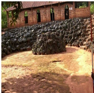
Plate 1: The Cylindrical Iron Blocks at Otobo Ugwu Dunoka, Lejja. (Agu and Opata, 2012).