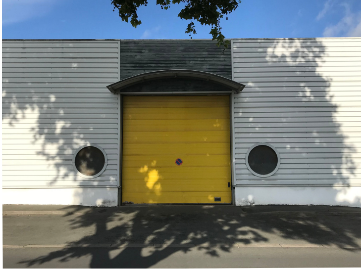
Figure 3: A visual scene used to illustrate the lightness constancy phenomenon.

We consider now an observer o associated to a (perceptual) achromatic effect (o_0, \mathbf{0}) . As explained before, this observer perceives the chromatic information of the two reflected lights ‘as they are’, which means that there is no variation between the chromatic features of the reflected lights and the chromatic features of the perceived colors. More precisely, we have