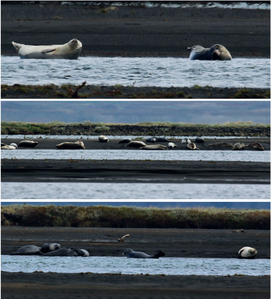
Fig. 4. Examples of photographs obtained for PID.

significant length without cover or topographic structure able to mitigate the sound of incoming tourists. This may provoke flush responses if the observers are not aware of the presence of seals (Granquist & Nilsson 2016), forcing the latter to flee to the sea or to search a new hauling site, less accessible to tourism or scientific observation. However, few anthropogenic sounds were recorded during the two days of observation. During fieldwork, our presence was sufficient