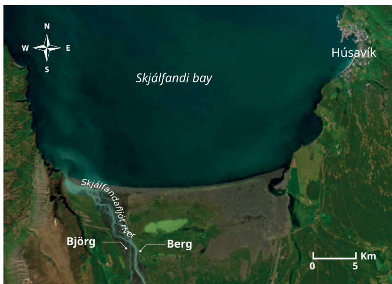
Fig. 1. Location of the two studied sites Björg and Berg in Iceland.

pioneer study explores the feasibility of photo-identification (PID) and extended behavioural studies in both Berg and Björg. We hypothesise that differences in time, and in accessibility and visibility between the two sites, will be associated with differences in the occurrences of different observed seal behaviours.