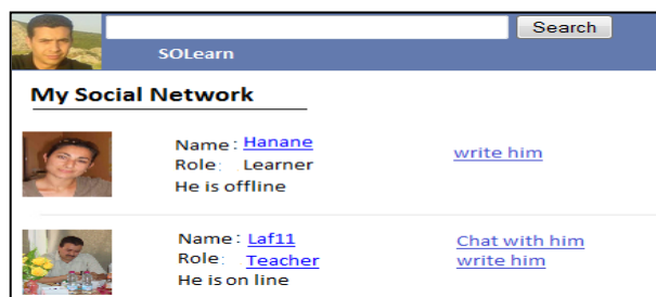
Figure 4. Example of a Social Network.