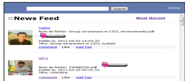
Figure 3. SoLearn Wall.

The learner can invoke the "News Feed" to see the last activities' updates of the learning community; it looks like the Facebook wall. The SoLearn Wall is a metaphor of the classroom where the teacher casts the lessons and the learners start asking questions, commenting, debating and exchanging ideas about the lessons;