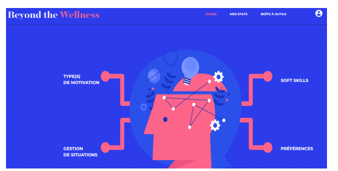
Figure 1. Landing page of "Beyond the Wellness".

Beyond the Wellness is an internal web application for employees in a digital company. The project was part of a participatory design (user-centered method) and coconstruction approach [3]. On a voluntary basis, each employee can complete four questionnaires through a 4point Likert scale (Figure 1): types of motivation (intrinsic, extrinsic or amotivation) [4], [5], stress management (desirability of control and coping strategies) [6], [7], soft skills (flexibility, open-mindedness, emotional intelligence, extraversion trait) [8], [9], and number of projects preferred (i.e. simultaneous activities carried out). Criteria were determined from a literature review on human factors that have an impact on performance and relationships at work.