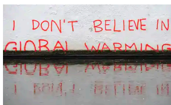
A 1-year-old graffiti near the Port of London in London, UK.

September 24-25, 2020, Geneva, Switzerland