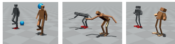
Figure 1: Example results of the control framework.

In an attempt to understand this reservation, we distinguish between two different approaches used in physics-based character animation research. On one hand, there are methods that compute joint torques based on kinematic parameters , such as joint angles or center-of-mass. These methods are relatively easy to implement and integrate well with common physics engines, such as the Open Dynamics Engine or PhysX . Recent publications that use this approach have displayed a variety of robust and versatile locomotion controllers (e.g. [CBvdP10, WFH10]). However, these methods allow style control only through key-framing or optimization for high-level criteria. Methods that use captured reference motions have several limitations or require extensive preprocessing (e.g. [SKL07, YLvdP07]).