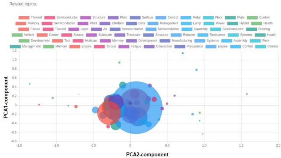
Fig. 3. Different concepts that are semantically close to the current selected concept. The recommendation system is working comparing concepts by 100-dimensional numerical vectors and depicts the closest ones based on PCA analysis.

The idea of physical effects extraction is not new in TRIZ. Thus, there are physical effects databases have been integrated to the majority of digital TRIZ supporting softwares [6], or the one available online without licence required [31]. The research describing the database of the physical effects is also presented in [32]. In our model we integrated the database of physical effects combined in [33]. Besides the effects (207 in total), the physical, electrical, thermal, magnetic, optic and mechanical properties have been extracted (30 in total). The importance of each property term is calculated based on the amount of occurrences in the full text of patent or scientific publication. With the help of this functionality the system allows to perform the physical effect oriented conceptual search and identify relevant concepts automatically. Several machine produced examples of identified concepts are depicted on Table 1.